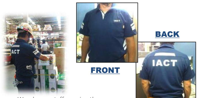
Warehouse staff wearing the new uniform at work.

The feedback on the new uniform has been positive overall. Many have found the new uniform very comfortable to wear and the shirt very suitable for summer as it is considerably cooler to wear than the former. The design is also a hit.