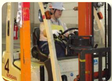
A female operator using forklift machine.

On July 31st, the 3rd IACT Competition for Forklift Safety Operation was held in Cargo Building 4 in the cargo area of Narita International Airport. The objective of this competition is to promote safe operations and accident prevention by further improving forklift operators' regulatory compliance and safety consciousness, as well as their operational skills. This year 20 staff members from various sections within import and export department were chosen as contestants, and each were to demonstrate their forklift techniques in front of visiting spectators – among them were employees and guests from customer airlines of IACT, Narita International Airport Corporation, etc.