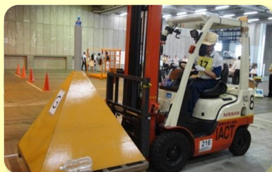
Forklift operators showing their skills while driving safety.

Contestants transport and store cargo using a forklift over the designated course (illustrated below) within a time limit of 10 minutes. The cargo prepared for the competition is a triangular pyramid shape with a long, narrow pipe placed unsteadily on top. This was done to simulate a certain situation in handling of sensitive cargo, i.e. precision machine parts that could be damaged even by a slight shock. Transporting this cargo proved to be difficult for many of the contestants as they must do so without the pipe collapsing down.